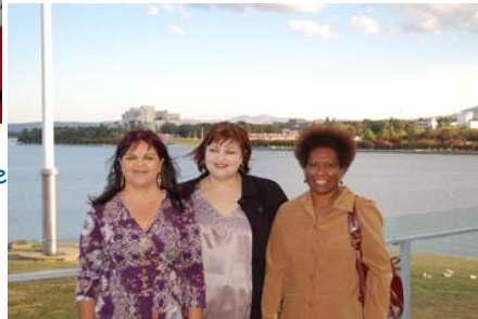
Right: Family Relationship Centre Townsville staff in Canberra