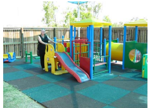
Play group area