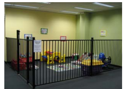
The Children's Play area