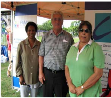
Left: Upper Ross Community Centre with Mayor Les Tyrrell