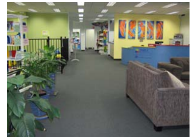
Inside The Family Relationship Centre Townsville