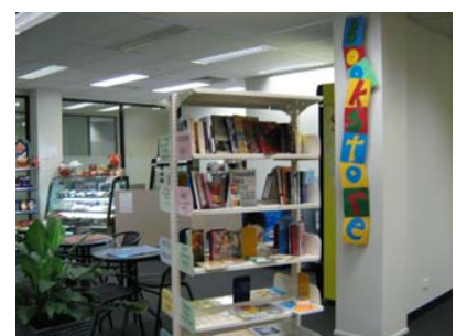
Refreshing Café and Bookstore.