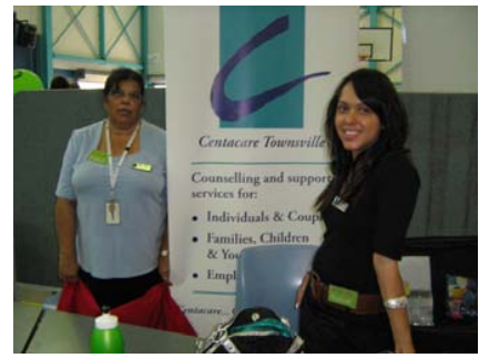
Above: Centacare Staff attend the Northern Beaches Health Expo.